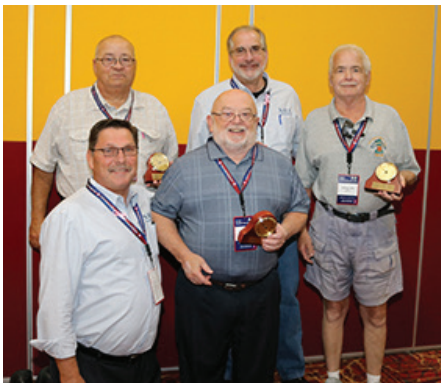
20 Year HBR Award Recipients.