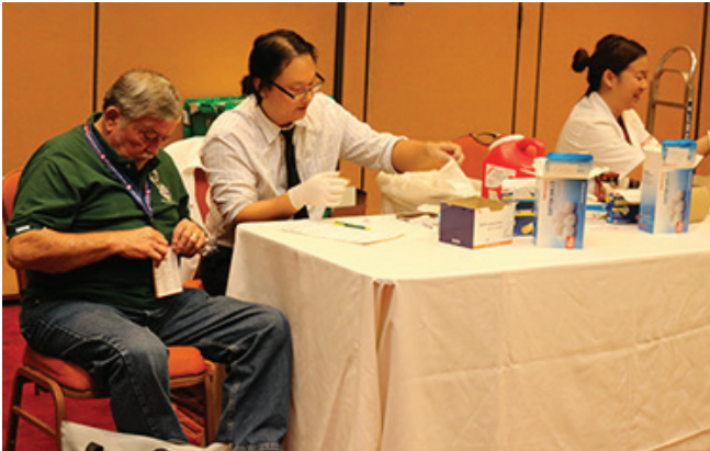
Health Fair - receiving Flu shots.