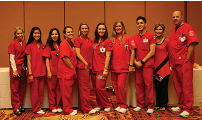
Health Fair - the UNLV nurse volunteers (Thank you!).