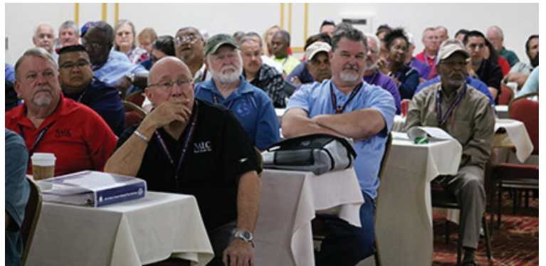
General Session attendees.