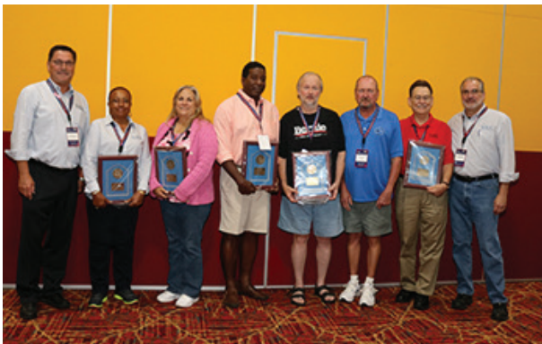
10 Year HBR Award Recipients.