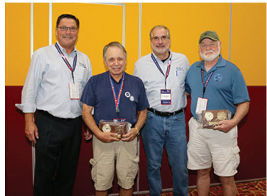
30 & 40 Year HBR Award Recipients.